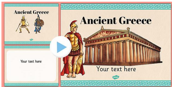
A PowerPoint presentation

Here are some suggestions about how you might want to present your findings. The final choice is up to you!